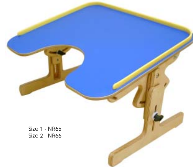
Size 1 - NR65 Size 2 - NR66

We are delighted that you have chosen to use a Jenx therapeutic product for your child. Jenx products come in all sorts of shapes and sizes and each one is designed to offer a better quality of life to children by improving their posture and therefore enabling them to do more. When a child finds that they can do something, it encourages them to try other things. This is the basis of motivation and motivation is built in to each of our designs. Jenx Limited has been designing and making therapeutic products for children for over 20 years. If you wish to have more information about any products in the Jenx range, please contact Sales Services on the number below.