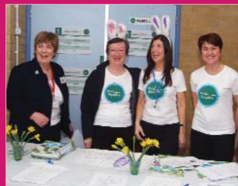
Kidz South organisers

Kidz South, which took place in Reading back in March was a resounding success, although we never doubted it would be!