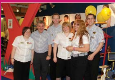
Jenx team at Kidz South