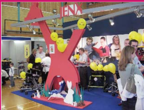
Jenx stand at Kidz South